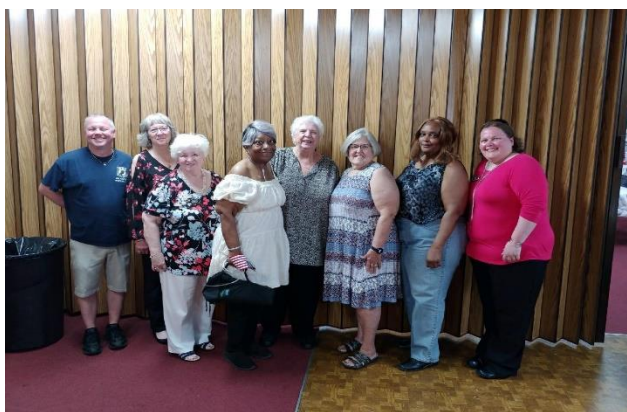
District 11 Commander/President Testimonial Dinner Auxiliary Members

Thank you to all auxiliary members for making my last 2 years as President productive. I wish the incoming officers a great year!