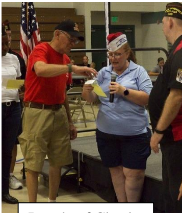
Parade of Checks