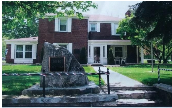
Ohio House – Built in 1935 and maintained by VFW Dept. of Ohio and Ladies Auxiliary – contains 2,874 sq.ft., 4 bedrooms, 2½ bathrooms.